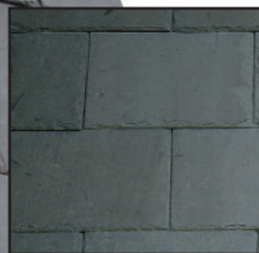
Semi-Weathering Vermont Gray