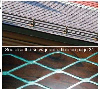
See also the snowguard article on page 31.