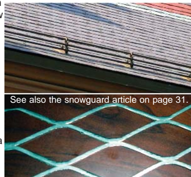
See also the snowguard article on page 31.