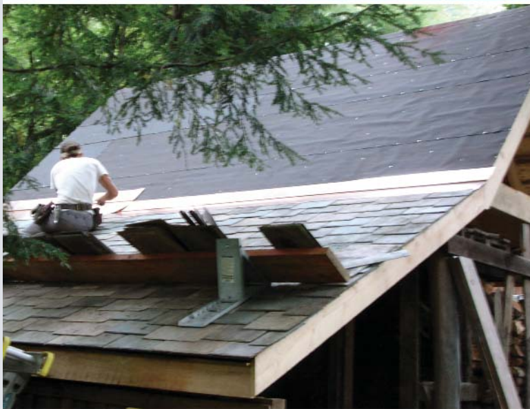
▲ A slope transition on a roof plane often requires a transition flashing, sometimes called an "apron." The flashing is folded with a Z bend to compensate for the angle of the slate on the upper half (making a cant strip unnecessary), and is nailed along the top edge, then held down along the lower edge with cleats, as shown. Dimensions vary, but 16", 20 ounce copper stock is shown used above. ▼ Unique slate siding and copper roofing installed by SRCA member Ron Kugel of Evans City, PA.