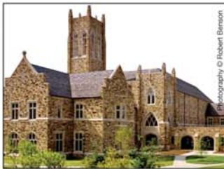
Color and texture match, the new Barret Library, Rhodes College, Memphis

When Rhodes College decided to build a new library at the center of campus, genuine Greenstone® Vermont Roofing Slate was selected for its beauty and longevity. They also wanted the roof to be visually consistent with historic buildings close by. We provided a blend of colors plus a variety of slate thicknesses for a match.