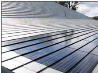
Energy saving Nu-Lok™ installation with integrated solar energy generation

Whether for a public building or a fine residence, Greenstone Slate® offers benefits relevant to today's goals, including new technology that provides lighter weight genuine slate installations. Traditional, natural and beautiful, slate still outperforms all other roofing materials even in a "greener" 21st century.