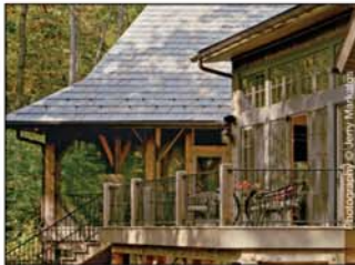
Country contemporary, energy saving Nu-Lok™ / Greenstone Slate® installation

Call for a comprehensive information kit and interactive CD with color guide: 800 619 4333