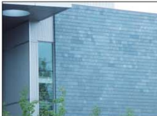
Cost effective stone cladding using the Nu-Lok™ installation system—University of Alaska

The University of Alaska found a cost effective, sustainable building cladding solution for their new science building. Greenstone Slate®, using the Nu-Lok™ installation system offered the longevity, aesthetic appeal, low environmental impact, excellent building serviceability, thermal protection—and, with Miami-Dade County acceptance, the necessary tolerance to wind and earthquakes.