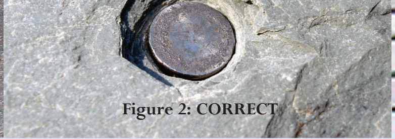
Figure 2: CORRECT