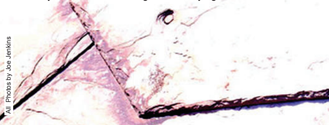
Figure 3: This is what happens to a standard-thickness slate over time if an underlying nail head rubs against it — the nail head eventually wears a hole through the overlying slate!

water to the nail hole and creating a hidden leak.