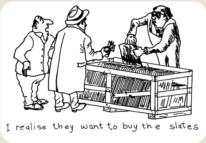
I realise they want to buy the slates