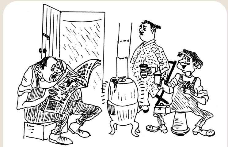
THE MEN SIT AROUND THE STOVE

The apprentice pretends to be cutting eaves slates on a bench in the corner where it is too gloomy to even see the slates never mind cut them. I explain my concerns regarding the wet stormy weather, the old lady's problem and the broken lorry. I don't think they hear me, must be the rain on the tin roof