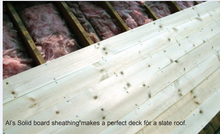
Al's Solid board sheathing makes a perfect deck for a slate roof.

Costs for the project added up to over $40,000.00, including slate, sheathing, dumpster costs, tools, snow guards, copious quantities of leaded copper, and structural enhancements to the load bearing capability of the building. The new slate roof, however, should easily last a century. Al's grandchildren will be able to admire his craftsmanship — as adults.