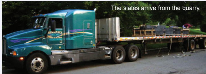
The slates arrive from the quarry.