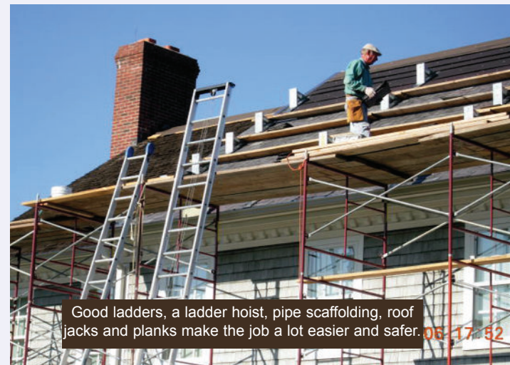
Good ladders, a ladder hoist, pipe scaffolding, roof jacks and planks make the job a lot easier and safer.

Many times, a handy-person or property owner will ask, after searching in vain for a competent roofing contractor, "Can I install my own slate roof?" With the proper information, tools, supplies, safety equipment and determination, and thanks to the efforts of sexagenarians, the answer is a resounding, "Yes!"