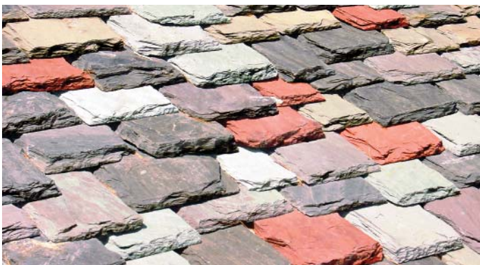
Figure 6: Staggered butt slate roof on the shores of Lake Catherine, Vermont. Slates vary in widths, and lengths, and, in this case, colors and thicknesses. The tops of the slates are lined up but the bottoms are allowed to hang down.