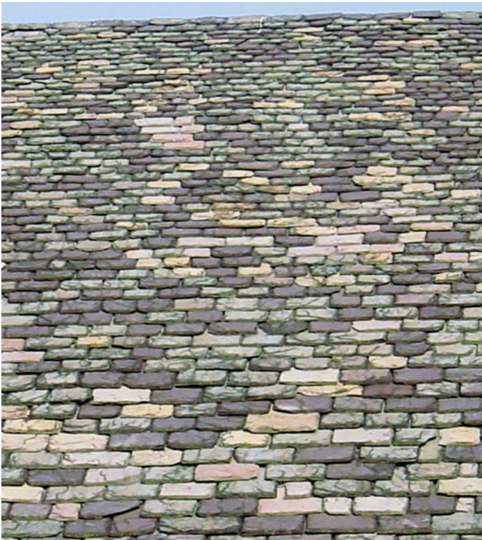
Figure 5: Graduated slate roof at Grove City College, Grove City, Pennsylvania. Slates vary in both widths and lengths. This roof also blends several colors of slate.