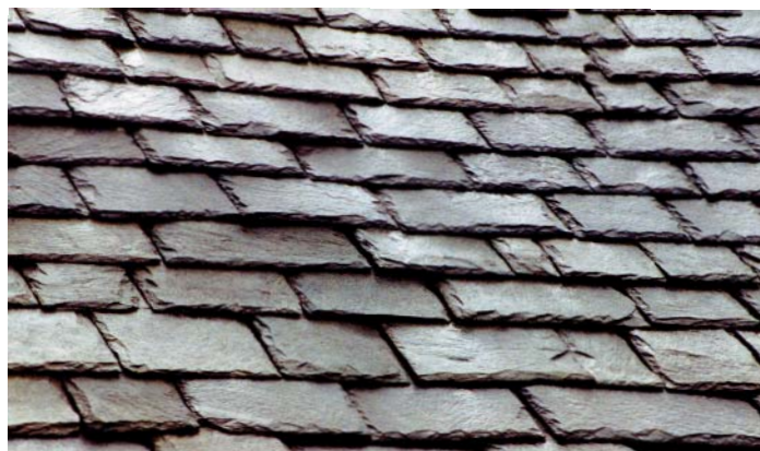
Figure 3: Random width slate installation in the UK.

✍ Got a friend or friends who would like to receive TR ? Send us the address(es) and we'll add them to our mailing list!