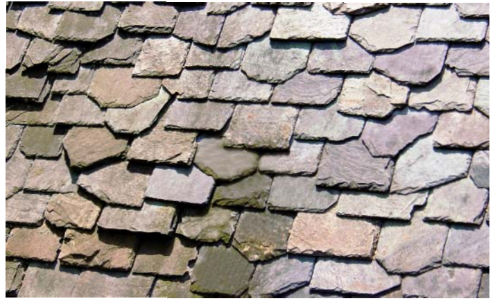
Figure 7: Ragged butt slate roof in Lake Forest, Illinois. Slates vary in widths, lengths, colors and thicknesses. The top of the slates are lined up, but the bottom is allowed to hang down. The bottom edges are trimmed at random to create a unique look.

Another method of installing a staggered butt slate roof is to use slates of different lengths. For example, random width and preferably multi-colored slates that are 16", 18" and 20" long can be nailed so that the top edges of all of