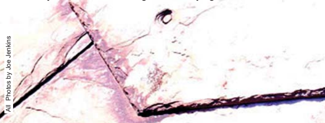
Figure 3: This is what happens to a standard-thickness slate over time if an underlying nail head rubs against it — the nail head eventually wears a hole through the overlying slate!

Footnote: The distance of the holes from the bottom of the slate should allow the slates to be installed with either a 3" or 4" headlap. This would place the holes the distance of the vertical exposure (as calculated for a 4" headlap) plus about 4.5" from the bottom of the slate. For example, on a 20" slate with a 4" headlap, the exposure would be 8" and the nail hole placement would then be 12.5" from the bottom of the slate. This placement would also allow the slate to be installed with a 3" headlap. ■