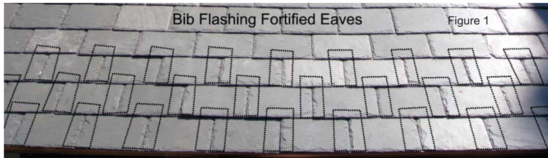
Each bib is at least 6" wide and slid up underneath the slates until they hit the slating nails.

A better approach, however, is to increase the headlap of the slates along the eaves. It's the headlap