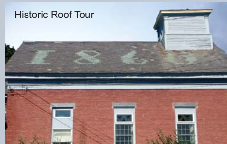
Historic Roof Tour