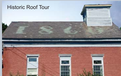
Historic Roof Tour